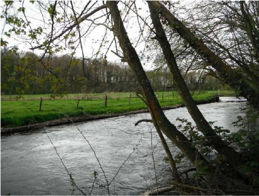
Photo 2 the river is overwide and straight providing a very poor variety of habitats; however there is some Large Woody debris present providing some variation

Photo 1 the river at the most upstream end of the Fairford parish is very wide straight and shallow and the adjacent land use is arable