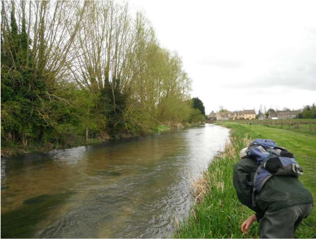
Photo 10 the road bridge at Fairford

Photo 9 the River in Fairford between the Mill and the main road bridge is again overwide, straight and shallo. It did have good marginal vegetation for species like water vole but was not ideal for natural fish populations although one fisherman reported regularly catching Grayling here.