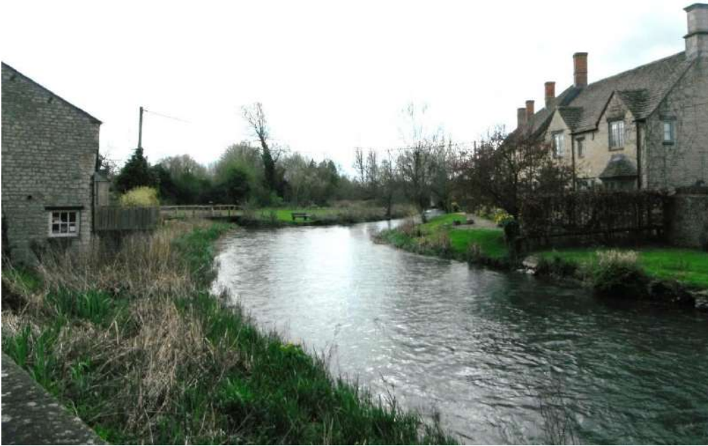
Photo 12 the river downstream of the town is still overwide and straight but it does have footpaths alongside it meaning local people have a good connection to the river

Photo 11 downstream of the bridge there are some homes built very close to the river and the channel soon splits again to indicative of another historic mill site.